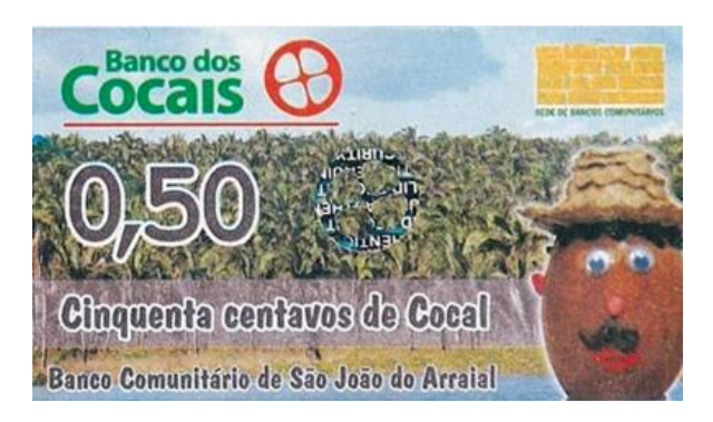
Figure 2: Cocais currency for Banco dos Cocais – São João do Arraial

"The ability to create yourself your own money, to have this power, that it is here because we decided that it would be like this, is great. And after you take this money and go buy the goods, this is a fantastic thing! We feel that people are surprised with this power." (quote, interview – December 1rst, 2011)