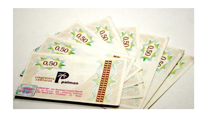
Figure 1: Palmas currency for Banco Palmas

The name Palmas clearly refers to the territory of the Conjunto Palmeiras , which was initially dotted with palm trees. The CCC consequently reflects the very name of Banco Palmas and its history, struggles and conquests (Melo, 2009). The name "Palmas" is indeed commonly used by inhabitants to refer equally to Asmoconp, Banco or Instituto Palmas, and the CCC.