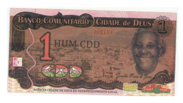
Figure 3: CDD currency for Banco Cidade de Deus – Rio de Janeiro