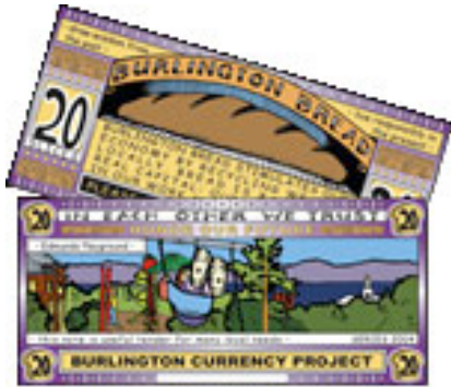
Figure 2: 20 slice note

section in the Seven Days newspaper with the public invited to participate in the voting by mailing in a ballot. A display and voting box was also made available at Boutlier's Art Supply Store on Church St. in downtown. Over 100 members of BCP and the public voted. The winner was determined to be a colorized version of the previous black & white bill with the addition of a new 20 slice note (Burlington Currency Project, 2004d).