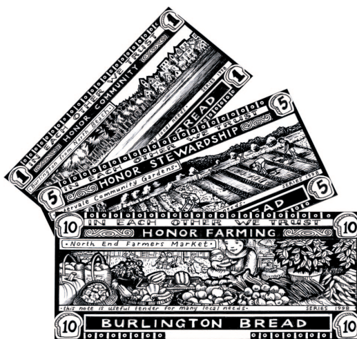
Figure 1: Original Slices